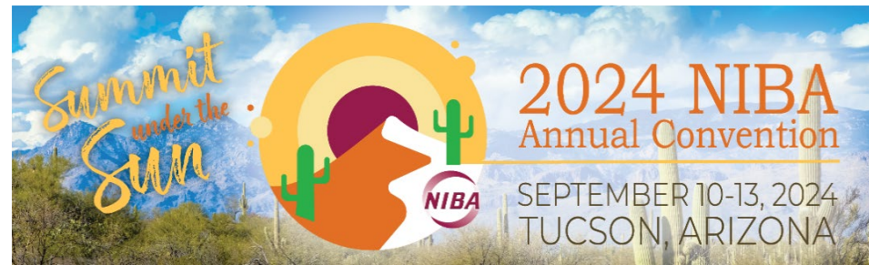
Exhibit Booth Assignments